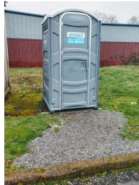
Rental of a porta-potty is the only financial commitment required for churches to

We started this program after a very specific conversation we had with a young lady whom we met during one of our outreach service days. She told us she was living in her car and we spent some time talking about safety and security. We told her about this program we were thinking of and she started to cry a bit. She went on to encourage us to continue building what we now know as SafePark. This young gal told us a story that precipitated the fuel behind this effort. It was a story of her first night in the car when someone broke her window and attacked her. As we looked at the broken glass and the broken girl, we knew we had to do something. The result is SafePark.